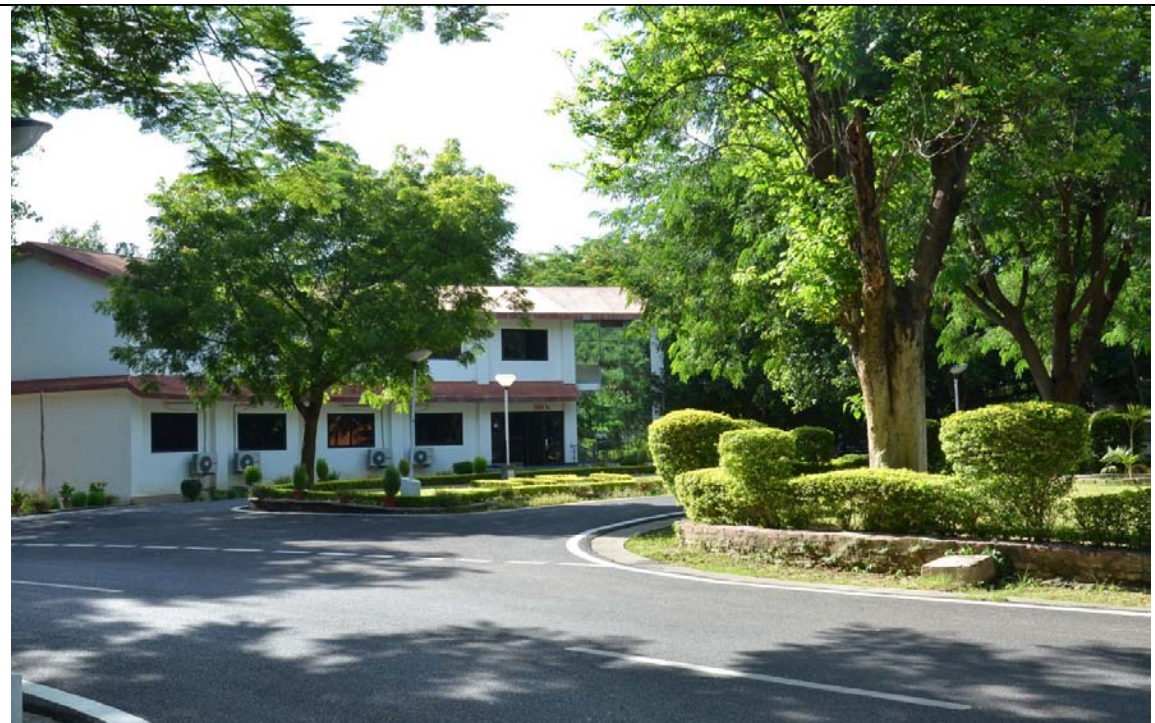
ENGINEERING BUILDING FRONT AREA