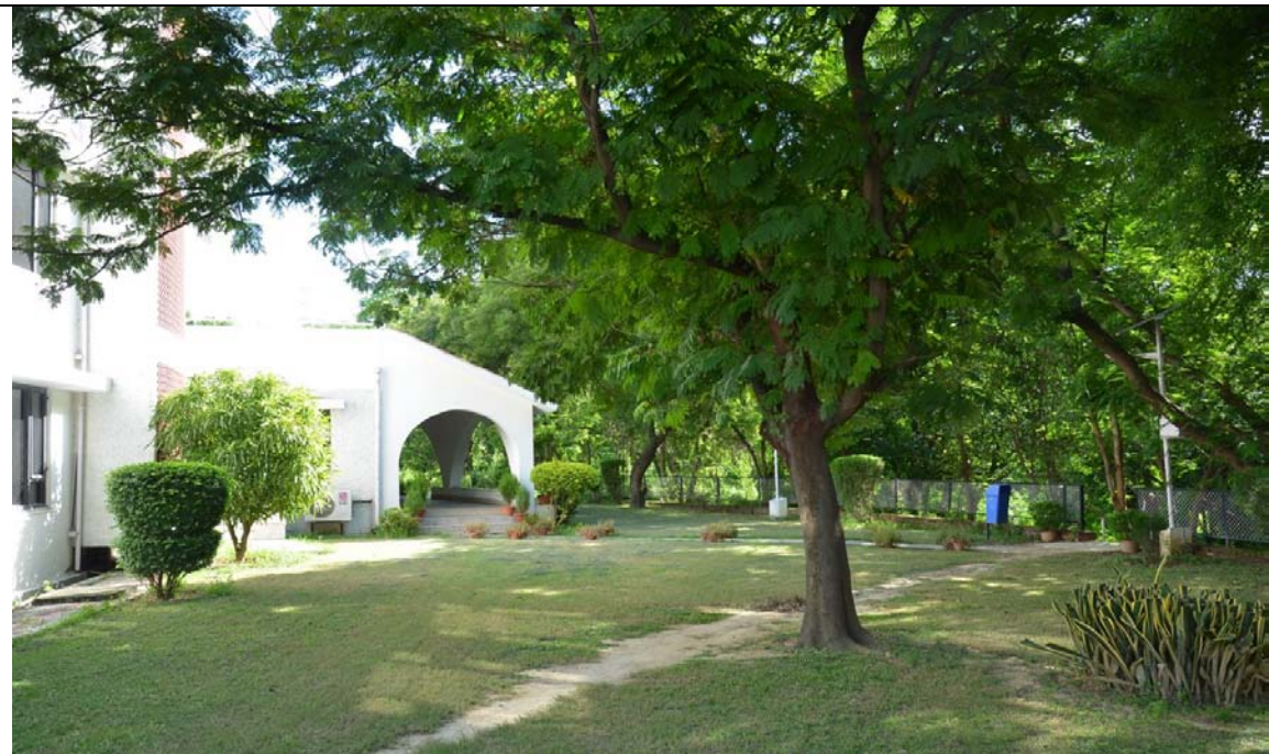
GUESTHOUSE REAR AREA