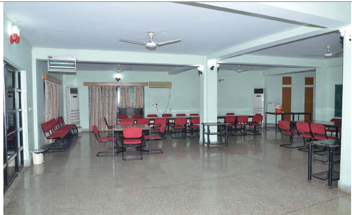
GUESTHOUSE DINNING AREA