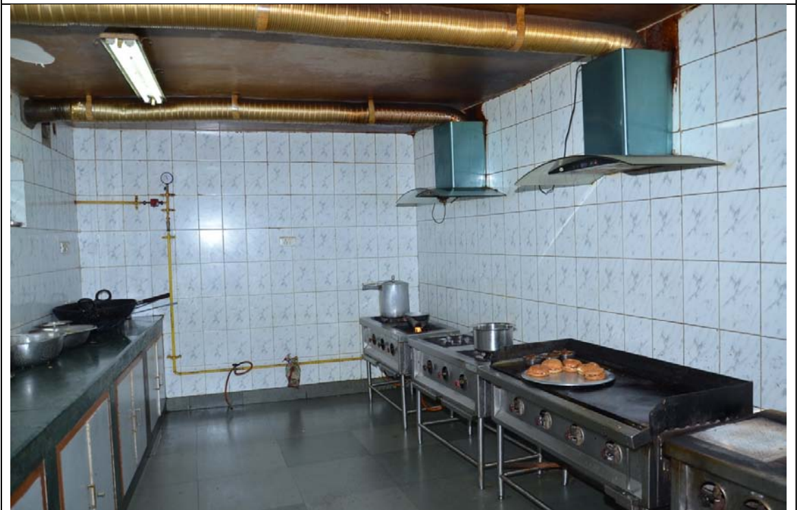
HOSTEL MESS KITCHEN