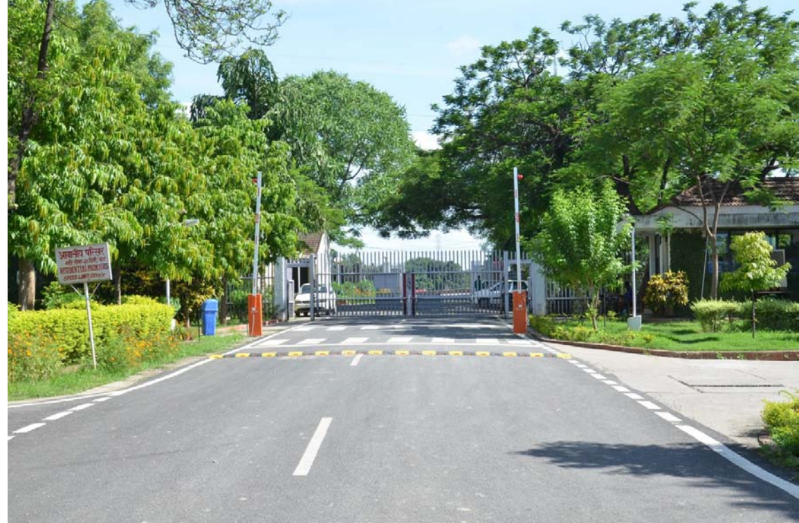
MAIN ENTRANCE GATE