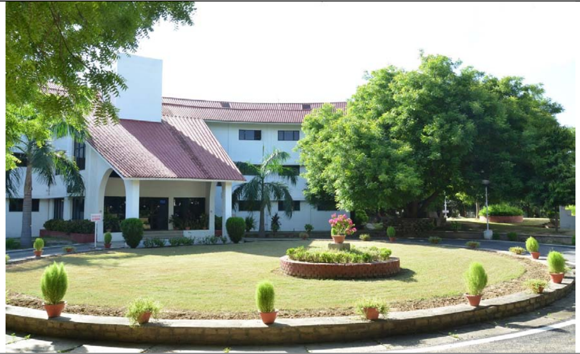
GUESTHOUSE FRONT AREA