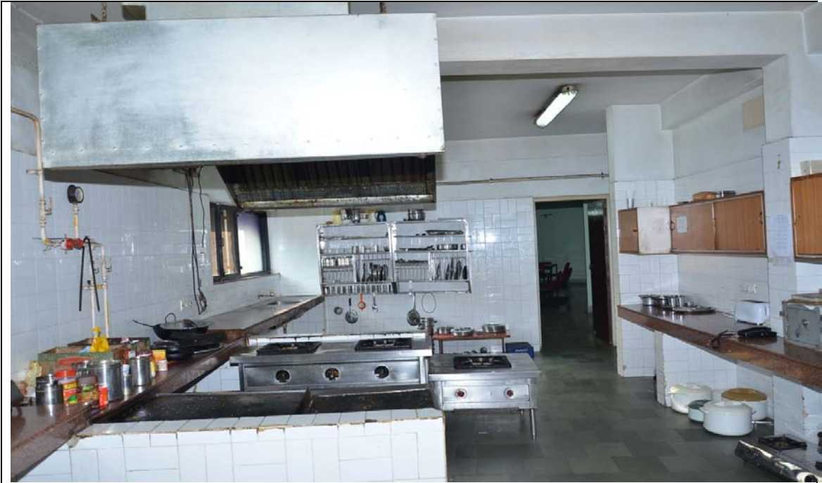
GUESTHOUSE MESS KITCHEN