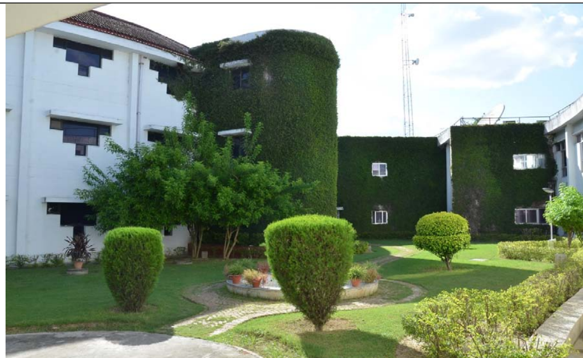
ADMINISTRATIVE BUILDING FRONT AREA