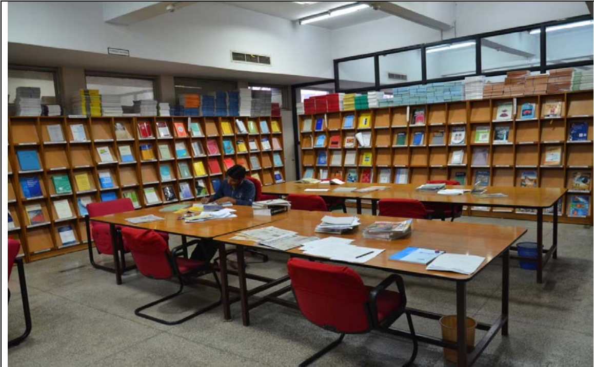
LIBRARY – READING ZONE