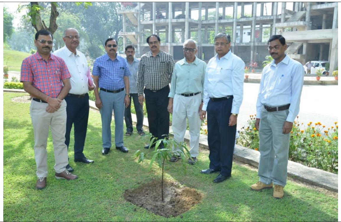
PLANTATION BY CHAIRMAN, AEC & SECRETARY DAE