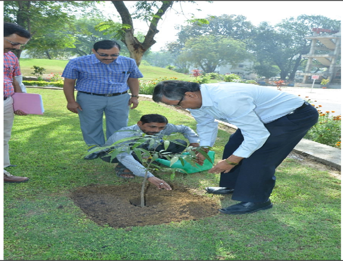
PLANTATION BY CHAIRMAN, AEC & SECRETARY DAE